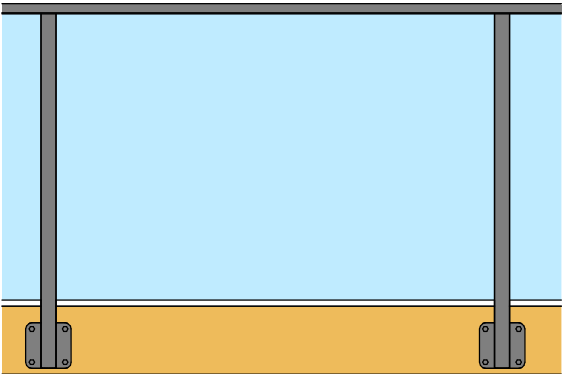
1500 mm Elevation 1 : 25